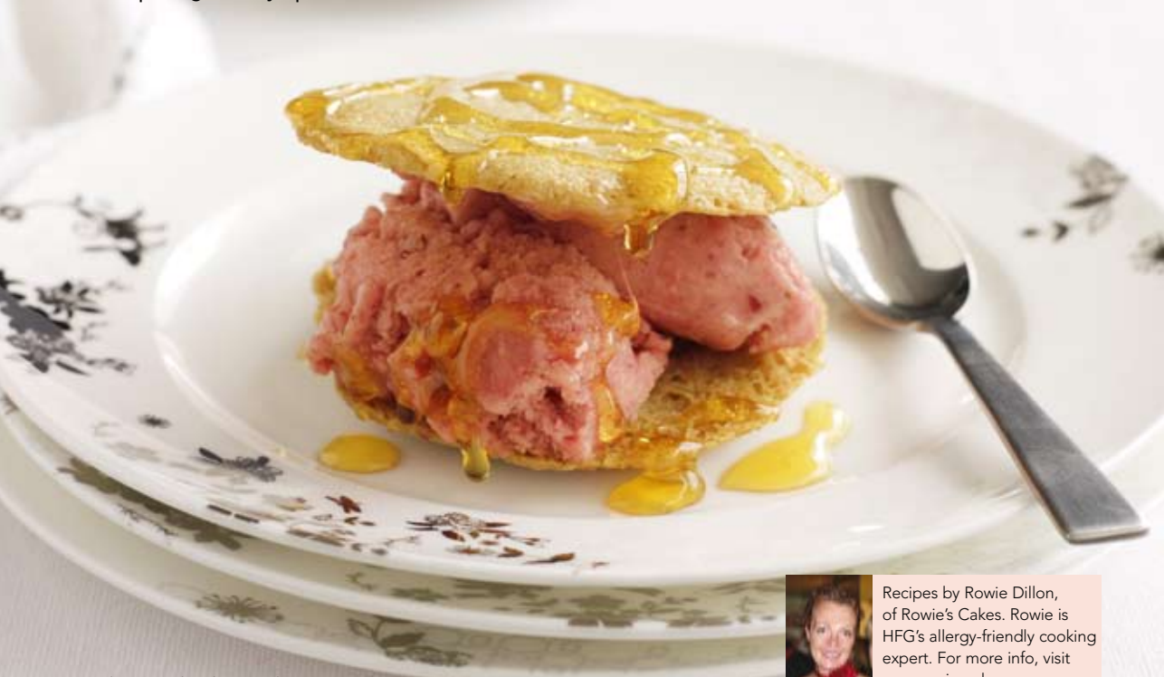
Sorbet sandwich in melting pastry