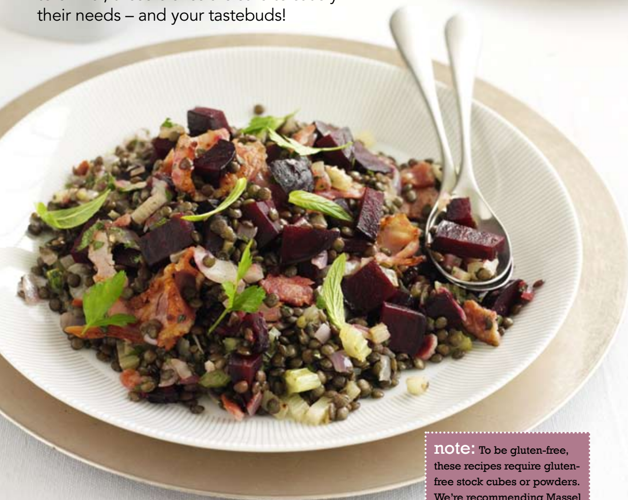
Bacon, beetroot and green lentil salad

Gluten-free, vegetarian, allergic to milk ... or just plain picky? Whoever's coming to dinner, these dishes are sure to satisfy their needs – and your tastebuds!