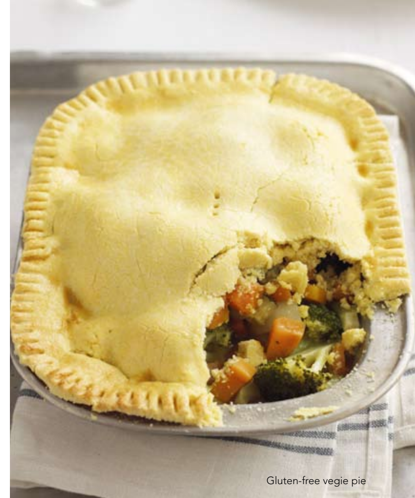
Gluten-free veggie pie

Step 2 Sift flours and polenta together in a large, chilled bowl. Add knobs of Nuttelex into the flour and, using your fingertips, gently rub it in until the mixture resembles fine breadcrumbs. Form a well in the centre and slowly add 2 tablespoons iced