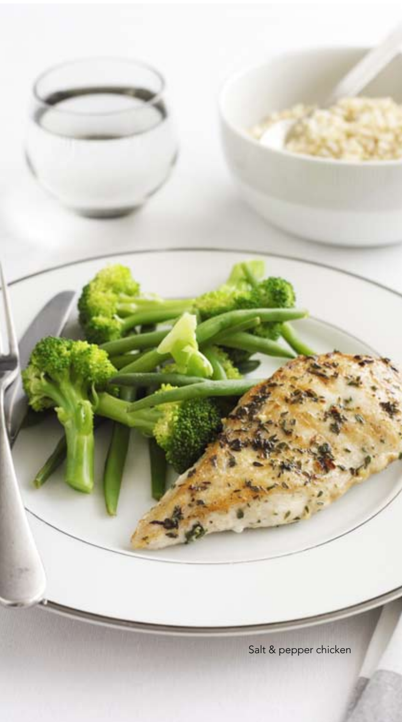
Salt & pepper chicken